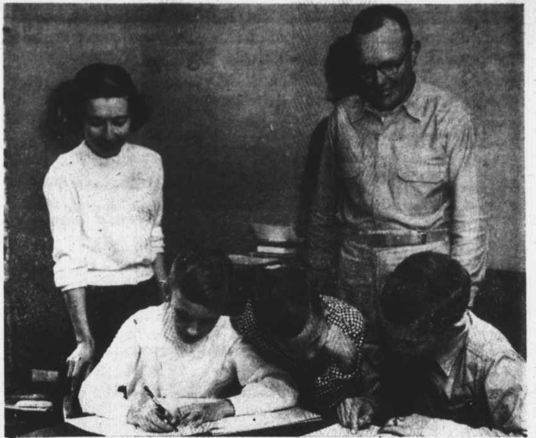
4-H WORK IS A FAMILY AFFAIR