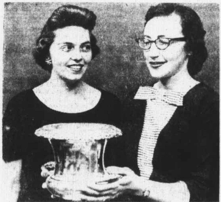
WINS TOP CLUB AWARD