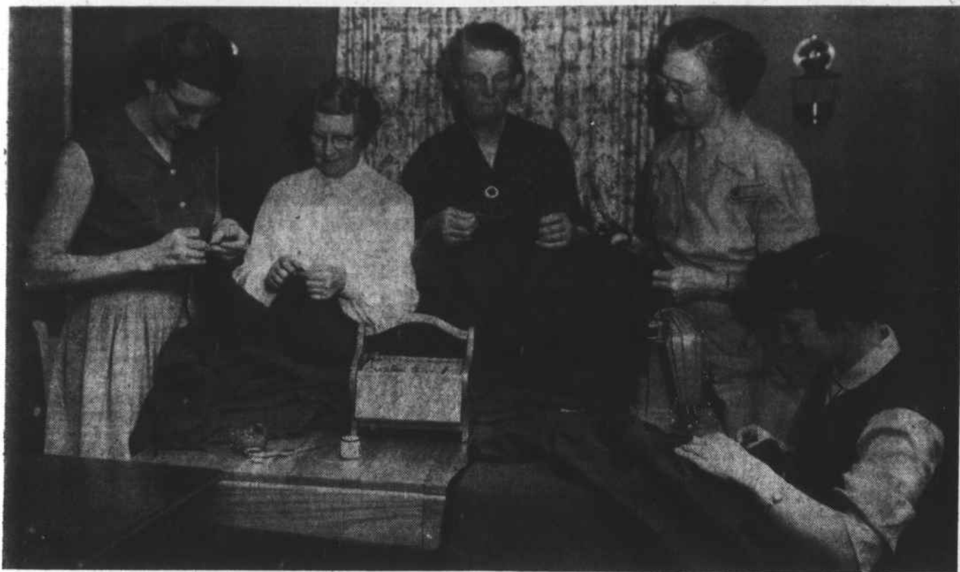
As a project this year, the women of the Cowee Home Demonstration Club have been taking surplus army blankets and hemming them for the first graders of Cowee School.