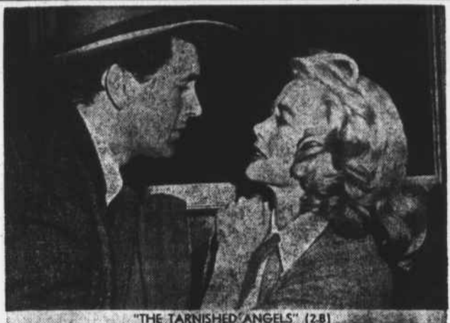
"THE TARNISHED ANGELS" (28)