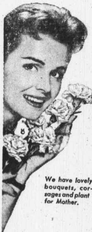
We have lovely bouquets, corsages and plants for Mother.

ORDER EARLY While the Selection is Best WEST'S FLORIST Phone 234-J FRANKLIN, N. C.