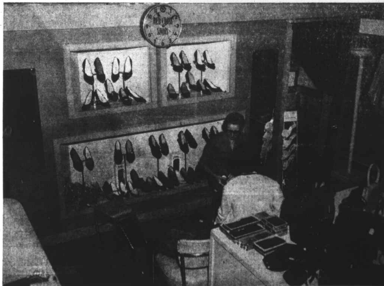
Attractive displays are one of the main features of Twins' Shop merchandising. Shown here are some of the latest in shoes and bags.