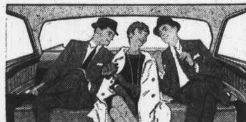
ANYONE CAN FIT IN A FORD: Our cars are built for people—full-size people who want space to stretch out. And all passengers ride in deep-cushion comfort.