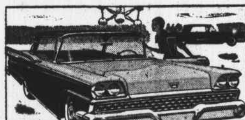
AT THE BRUSSELS WORLD'S FAIR, the '59 Fords were awarded the Gold Medal for handsome new styling elegance by the Comité Français de l'Elegance.