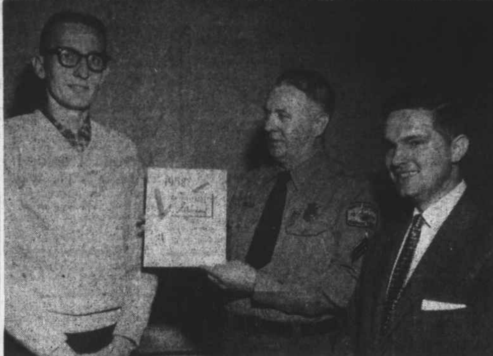
JAYCEES RECEIVE STATE AWARD

Swine producers should follow a strict vaccination program to prevent hog cholera.