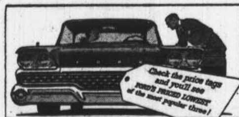
THE FAMOUS FORD LOW PRICES have already made a hit, because only in Fords will you find value and beauty coming together at down-to-earth prices!

The world's best-selling car is the car with Thunderbird elegance