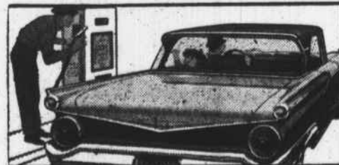
YOU'LL BE THANKFUL EVERY TANKFUL if you buy the new Ford, for you'll save up to a dollar a tankful with new engines that run superbly on regular gas.