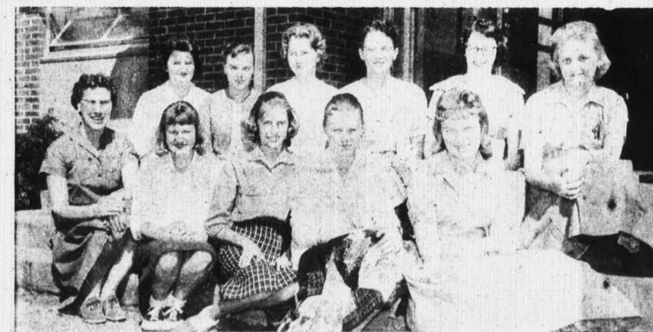
FUTURE HOMEMAKERS ATTEND STATE RALLY IN RALEIGH SATURDAY

If ratified, the bill would make the changes effective April 1, 1959.