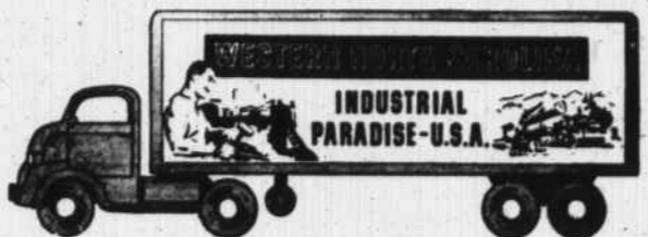
PICTURED ABOVE is the advertising the W. N. C. Industrial Development Corporation plans to put on the sides of its traveling trailer truck exhibit.