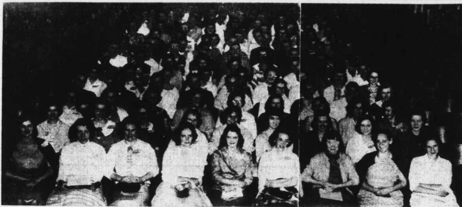
FRANKLIN HIGH HAS LARGEST DELEGATION AT WESTERN CAROLINA FOR HIGH SCHOOL SENIOR DAY