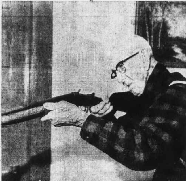
... Once was the best marksman in the county.