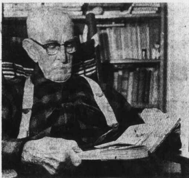
... Secret of long life? It's in his Bible.