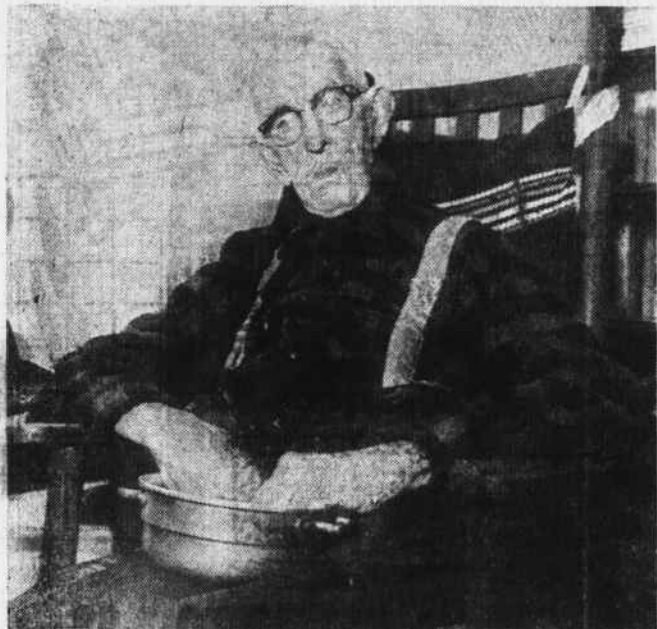
... Shelling "leather britches" helps out.