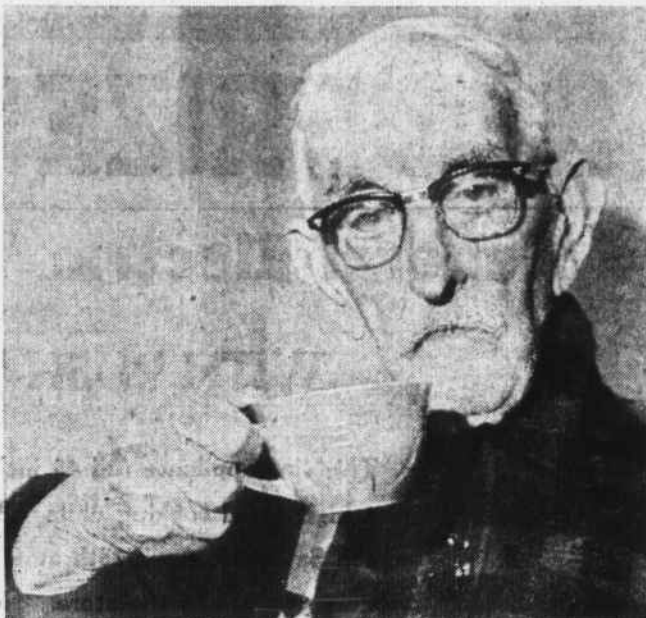
... He's got a real lasting taste for coffee.