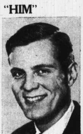
For "HIS" Comfort

See the new Mennen Shave Set with new Mennen Foam Shave, Mennen Spray Deodrant and After-shave Lotion.