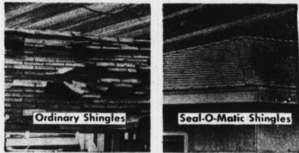
These houses were side by side.