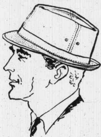
IMPREGNOLE-TREATED COTTON POPLIN RAIN HAT