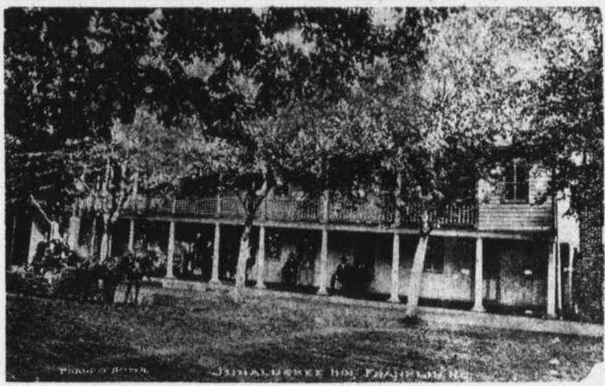
REMEMBER THIS OLD FRANKLIN SCENE?