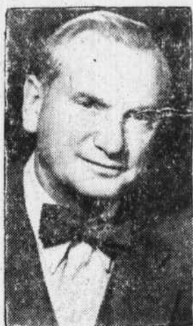
Dr. Swalin No. 4

More than 1,500,000 volunteers in 10,000 communities throughout the nation are expected to participate in the house-to-house fund collection on "Heart Sunday", February 28.