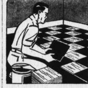
All you need for the floor is: Floor Tile, Mastic, Spreader, Chalk and Chalk

The above RECREA-TION ROOM can easiy be built by yourself, or by your favorite builder, or by a reliable builder that we will be glad to recommend.