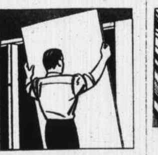
lovely - to - look walls. You will need: Nails, Finish, Wood Mouldings.

The above RECREA-TION ROOM can easiy be built by yourself, or by your favorite builder, or by a reliable builder that we will be glad to recommend.