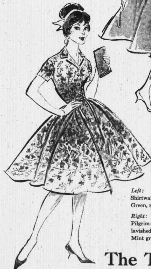
Left: Shirtwaist dress in printed cotton voile. Green, red or gold on white. Right: Pilgrim-collared sheer cotton de soie lavished with lace and tiny buttons. Mint green, pink, blue or yellow.

for the prettiest way to keep flower-fresh through sunny summer days. Sheer cottons . . . both tiny-waisted, bouffant-skirted, with the wide hems that look so expensive!