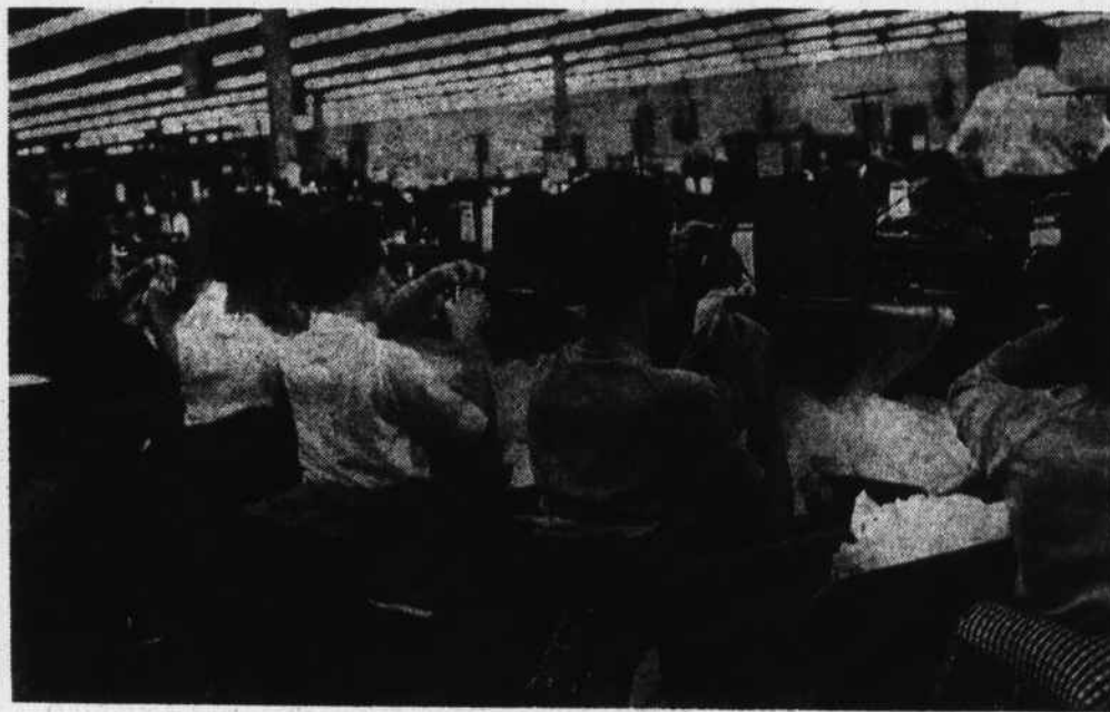
AT THE COMPLETION of the training program, the employee is placed in the looping department of the main plant, where she starts earning her money for the plant that trained her. Shown are experienced loopers at work.