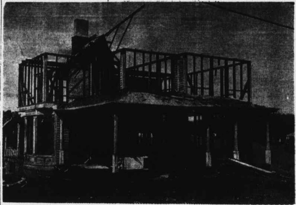
THE OLD TROTTER house at the side of the First Baptist Church is bowing to progress. The house, which is about 100 years old, is being razed to make way for a parking lot. Oldtimers recall that the house once was on Main Street and was pulled to its present location by a single horse.