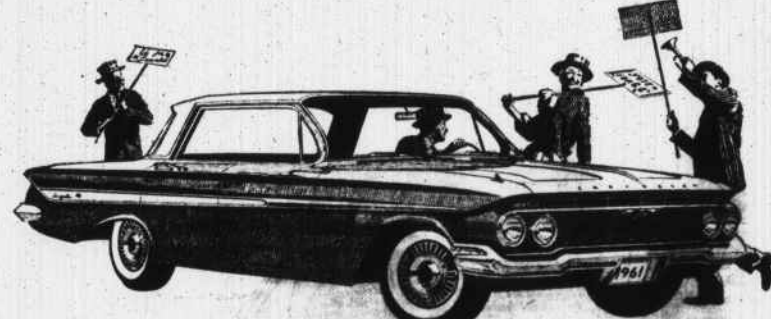
New '61 Chevrolet IMPALA SPORT SEDAN You've got five Impalas to pick from—models that put the accent on luxury while offering all of Chevy's new ideas about comfort and convenience—like larger door openings, higher seats, and a low-loading deep-well trunk.

Here's a better way to choose your new '61 car. Now your Chevrolet dealer offers a range of models to suit almost any taste or need—in a range of prices to suit any budget. It's the greatest show on worth! A full crew of low, low-priced new Chevy Corvairs, including four wonderful new wagons. New Chevy Biscaynes—offering big-car comfort at small-car prices. Beautiful Bel Airs, elegant Impalas, and the incomparable Corvette. Shown below are just 5 of the 30 different models you can pick from. Come on in and make your '61 car-shopping rounds the easy way—all under one roof!