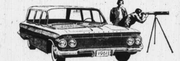
New '61 Chevrolet BROOKWOOD 9-PASSENGER STATION WAGON All six Chevrolet wagons feature a cave-size cargo opening that's nearly five feet across! . . . plus a new concealed compartment (lock is optional at extra cost) for stowing valuables.