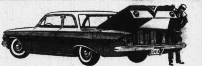
Presenting big-car beauty at small-car prices NEW '61 CHEVY BISCAYNE 6 (2-Door Sedan, above) All Biscaynes, 6 or V8, give you a full measure of Chevy quality, comfort and proved performance. Yet they're priced right down with many smaller cars that give you a lot less!