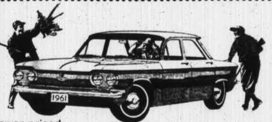
New lower priced '61 CORVAIR 500 4-DOOR SEDAN Like all Corvair coupes and sedans, this model costs less for '61. You get more spunk, space and savings—and now Corvair has wagons, too!