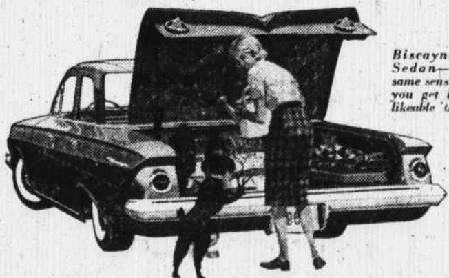
Biscayne 4-Door Sedan—with the same sensible design you get in all the likeable '61 Chevys.

For big-car comfort at small-car prices Biscaynes—6 or V8—give you a full measure of Chevrolet quality—yet they're priced down with many cars that give you a lot less!