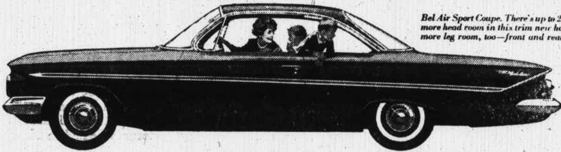
Bel Air Sport Coupe. There's up to 2 inches more head room in this trim new hardtop; more leg room, too—front and rear.