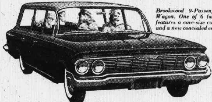
Brookwood 9-Passenger Station Wagon. One of 6 for '61. Each features a cave-size cargo opening and a new concealed compartment.