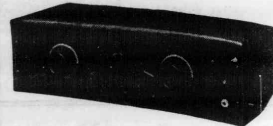
This is the CROSLY TRIRDYN 3R3

Whoso denieth the Son, the same hath not the Father; but he that acknowledgeth the Son hath the Father also."—1 John 2:21-24.