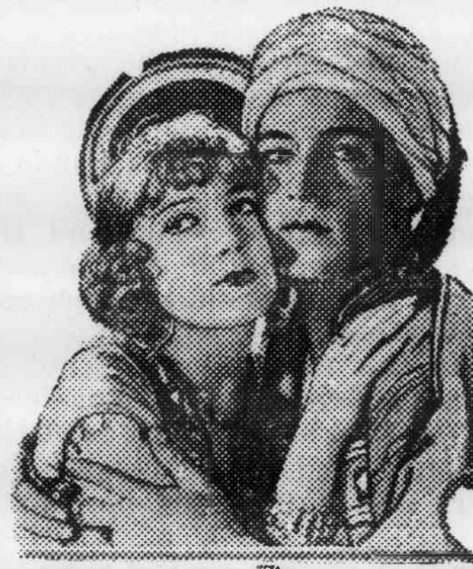
UDOLPH VALENTINO, "SON of the SHEIK" With Vilma Banky

Bohème a Metro-Gwynne Mayer PICTURE PINEHURST THEATRE ONLY FRIDAY and SATURDAY September 17 and 18 AT REGULAR ADMISSION PRICES 8:25