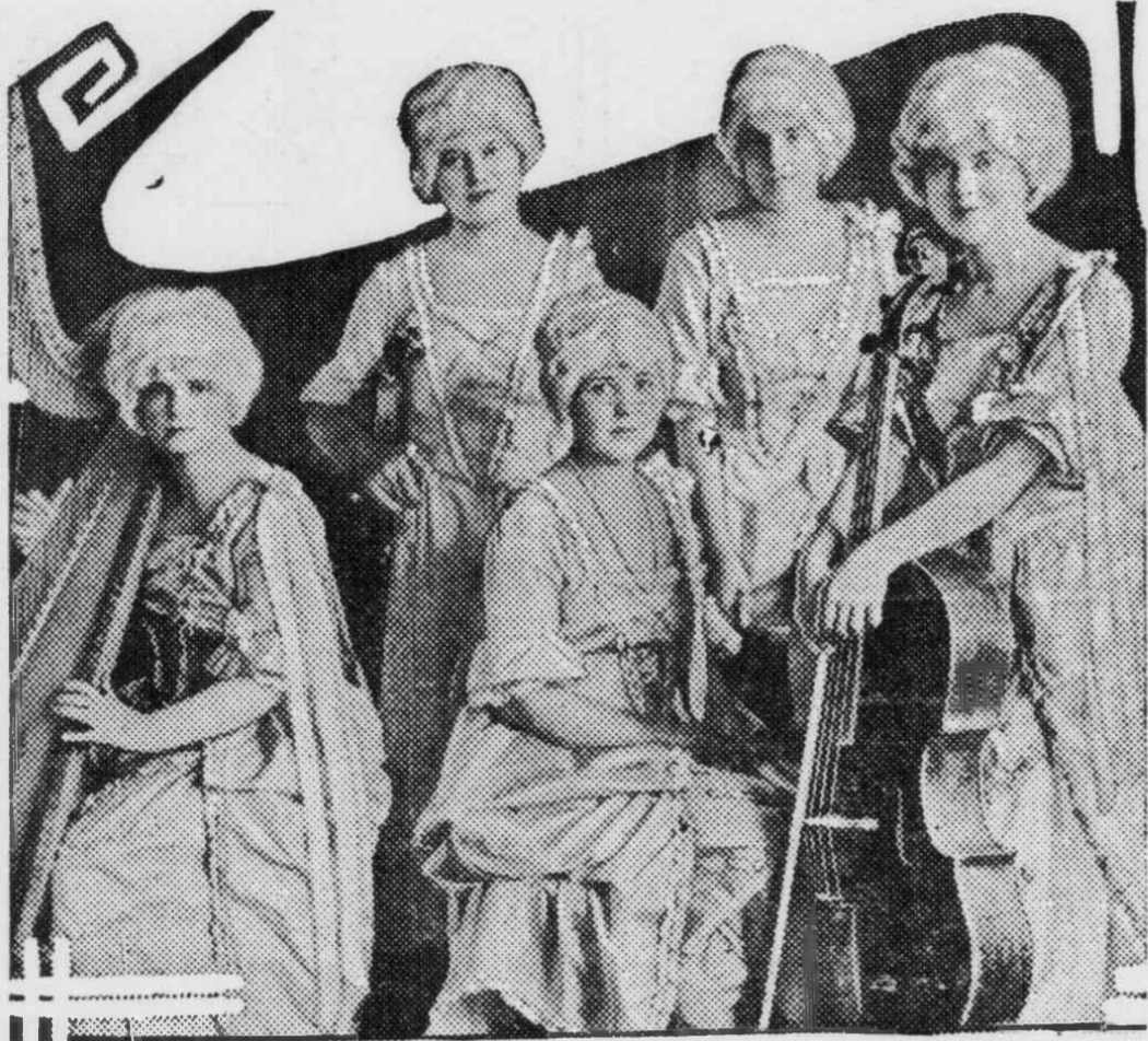
The Harp Symphony