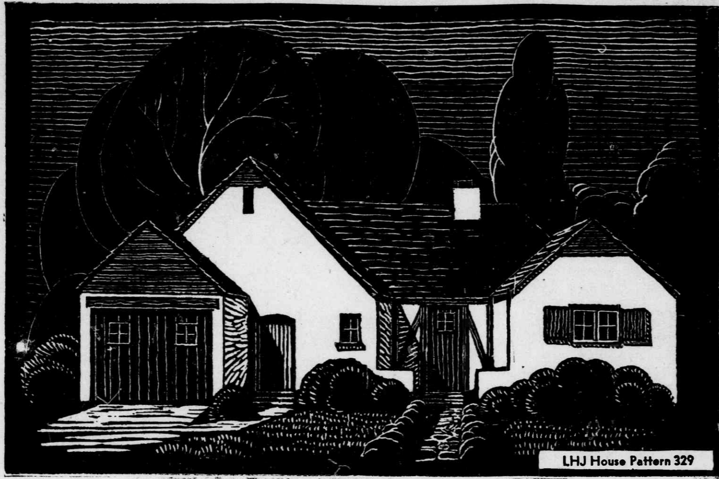
GARDEN HOME WITH IDEAL FLOOR PLAN

The location of the expanding building is not far out from the Carolina, just beyond some of the most striking buildings of that quarter. With its rural touch it will be a connection between the village and the larger estates beyond, for Mr. King has a considerable acreage, an orchard that is well kept, and such landscape accomplishment as gives to a country home much of the attractiveness that this favored section makes possible. The style of architecture is that Sandhills feature that Yeomans has made so conspicuous in a number of places in and about the villages. It will emphasize the extension of Linden avenue, and encourage further filling in of the gaps between the Carolina and the Reed home on Sandy Run.