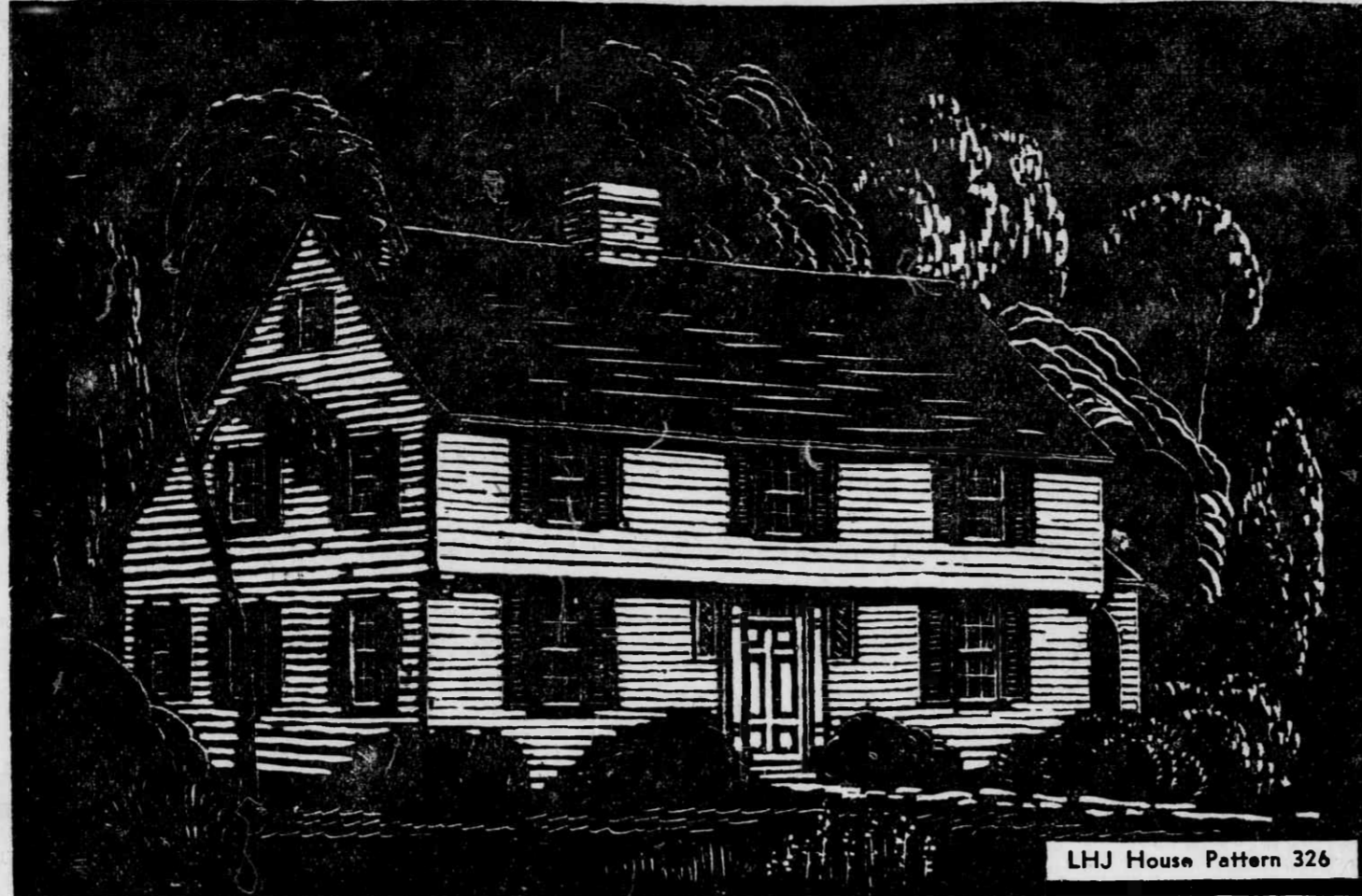
LHJ House Pattern 326

Not far from the talc mines several hundred thousand dollars' worth of gold has been mined in the days gone by, the old mill equipment showing at two or three places where the treasure was yielded up to the comfort of the older generations. A lot of gold is still in the ground up that way, perhaps in quantity to pay for