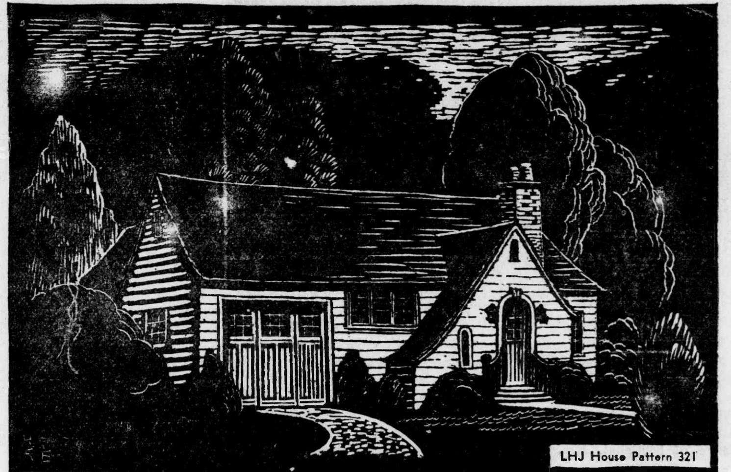
LHJ House Pattern 321