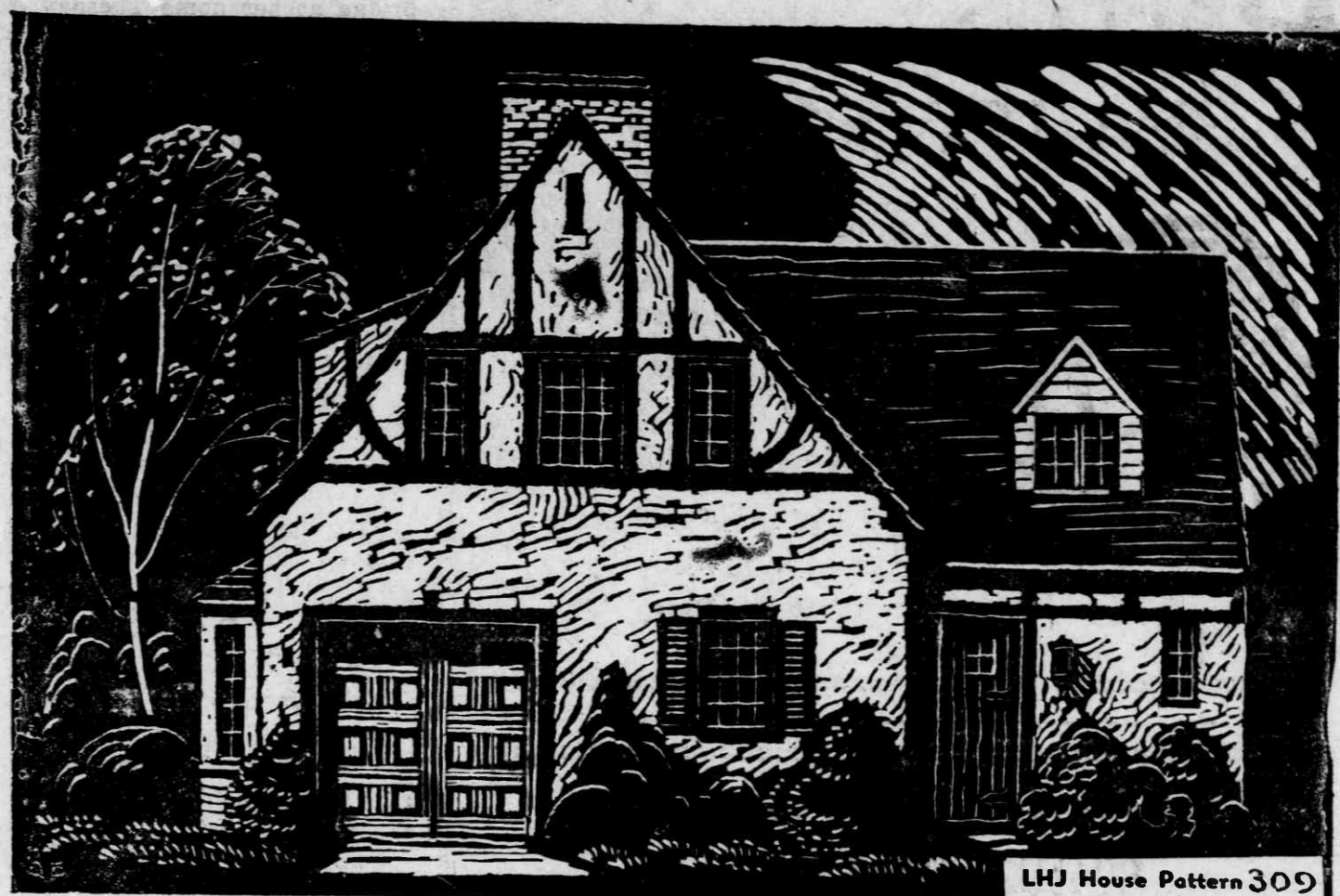
LHJ House Pattern 309