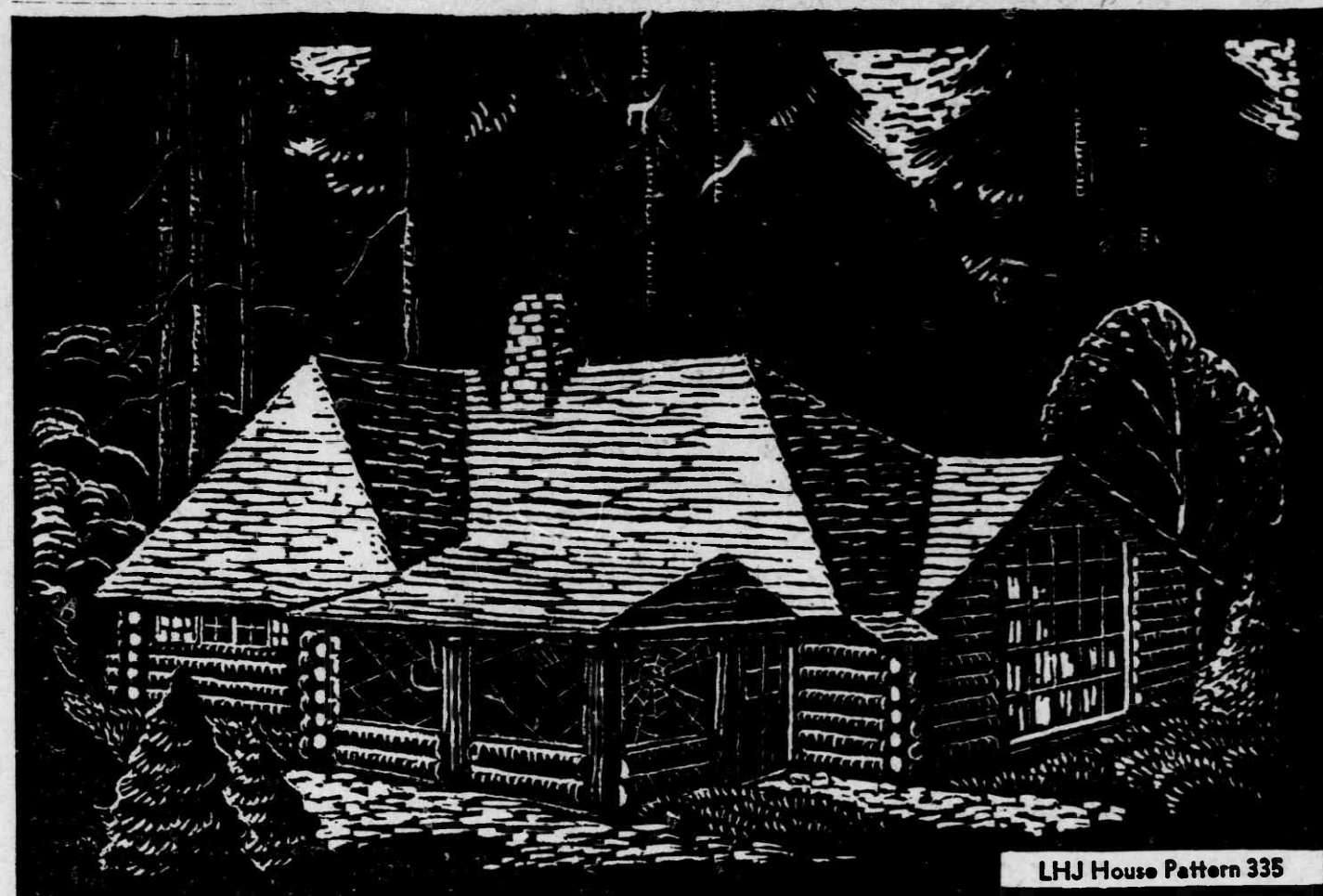
LHJ House Pattern 335