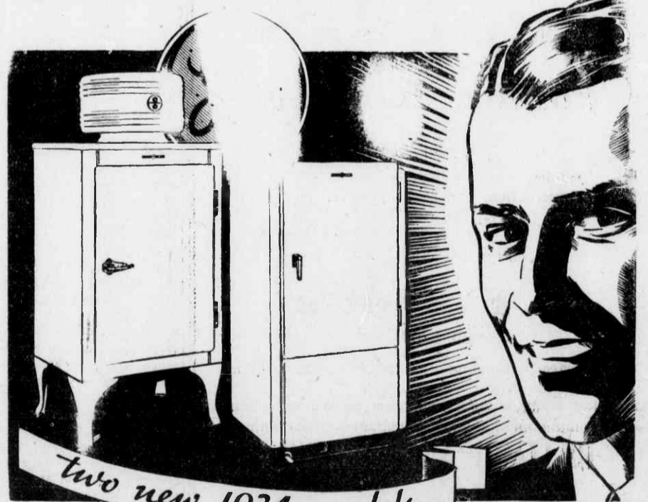
two new 1934 models

Here are the finest Refrigerators General Electric ever built