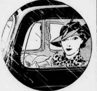
FORD CLEAR-VISION VENTILATION banishes the "blind spot" forever. Each window is in a single rattle-proof piece.