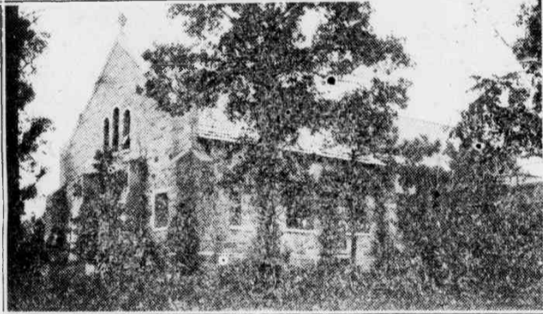
Emmanuel Episcopal Church