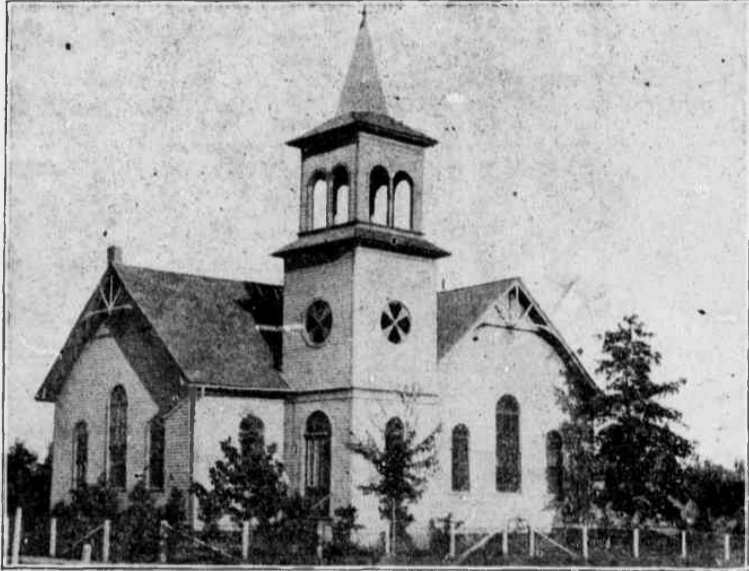
St. Anthony's Roman Catholic Church