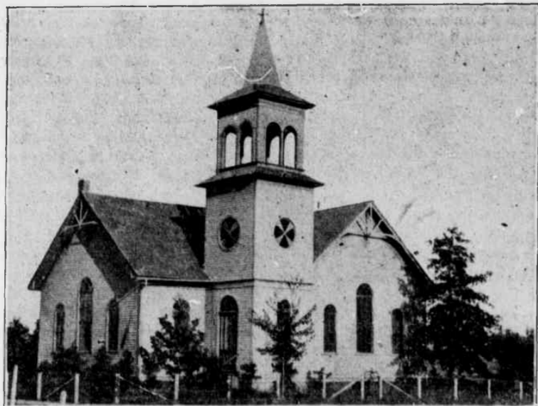
This Church Edifice has been in continual use since 1899. Plans have been prepared for a new church building which the congregation hopes to erect in the near future.