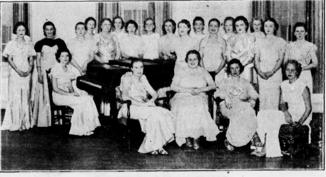
THE MEREDITH COLLEGE GLEE CLUB

The Glee Club will give a concert tomorrow, Saturday night in the Southern Pines High School Auditorium at 8:00 o'clock. The program will consist of classical music rendered by twenty-two well trained young women from one of the leading colleges of North Carolina, and those who have heard them before will know what to expect. They have a state-wide reputation. A charge of 35 cents will be made for grown-ups, 15 cents for children.