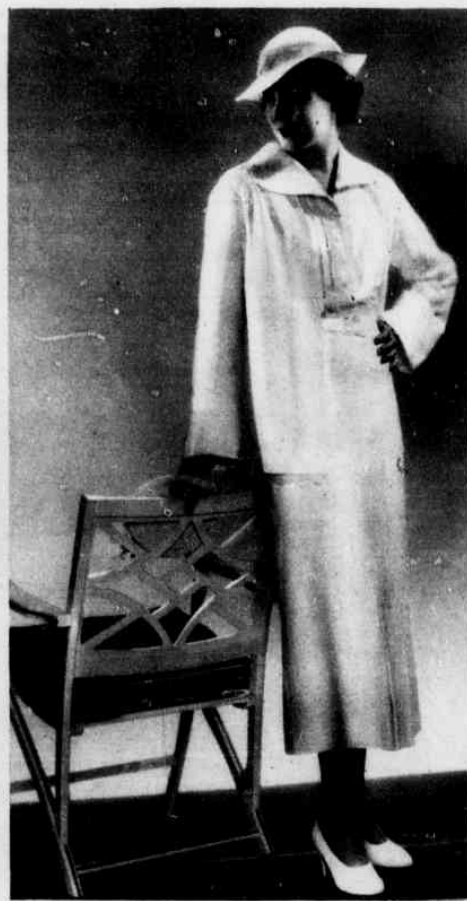
LINEN ENSEMBLE Pattern No. H-3154

Here's the perfect design for that really all-round use- ful suit, sometimes called the trotteur suit.