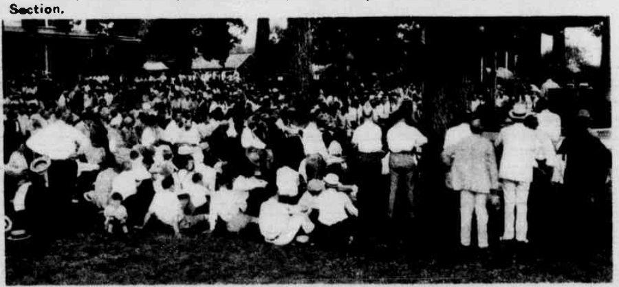
A day's outing at the Experiment Station, near Oxford, which helps these good farmers to become ever better farmers.