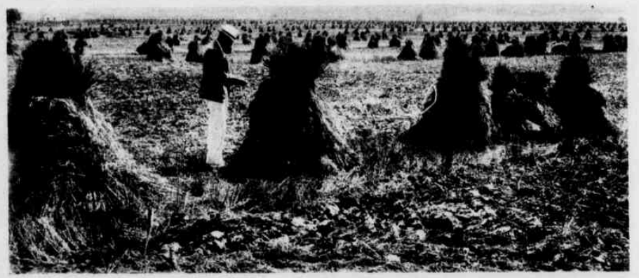
Grain, such as this, is also an important crop in North Carolina's Piedmont