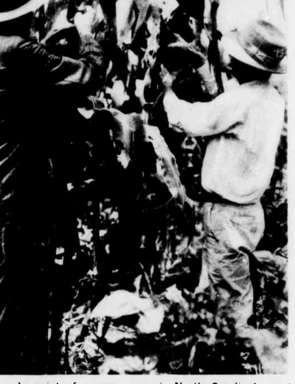
In point of acreage, corn is North Carolina's most

The central Piedmont also needs soil improving practices, however, we find in this area, the most diversified farming, specializing in small grains and dairying. Where tobacco predominates along the Virginia border and where cotton rules the South Carolina border we find the greatest need for more diversification