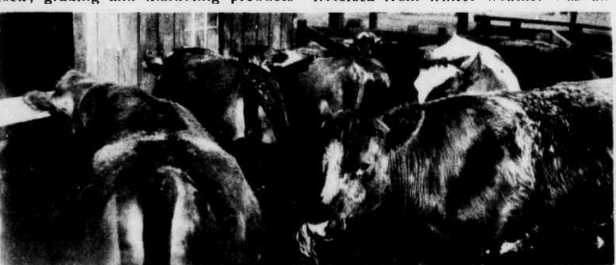
Cattle come in for an important part in the state, too. This picture was

To the reasons cited for selecting North Carolina as my future home, I can now add many more, including excellent highways, water, rail, motor, and airplane transportation to where;" hydro-electric power in abundance developed within the state's own borders and the rural electrification program fast being put into effect; a State Agricultural College and a Department of Agriculture that are outstanding. Just add the soil conservation program to these and you can readily see why there is a bright future for North Carolina. It has ranked fifth on an average in the total value of all crops in the United States for the past three years. Tobacco alone returns more than $100,000,000 annually. It has five crops each valued at over $10,000,000 each year, which in the order of their acreage rank are, corn, cotton, hay, tobacco, and peanuts.