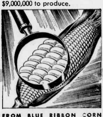
FROM BLUE RIBBON CORN Hiram Walker pays premium prices for corn as rich in flavor as Ten High itself. If a shipment fails to meet Hiram Walker's high standards, it is rejected.