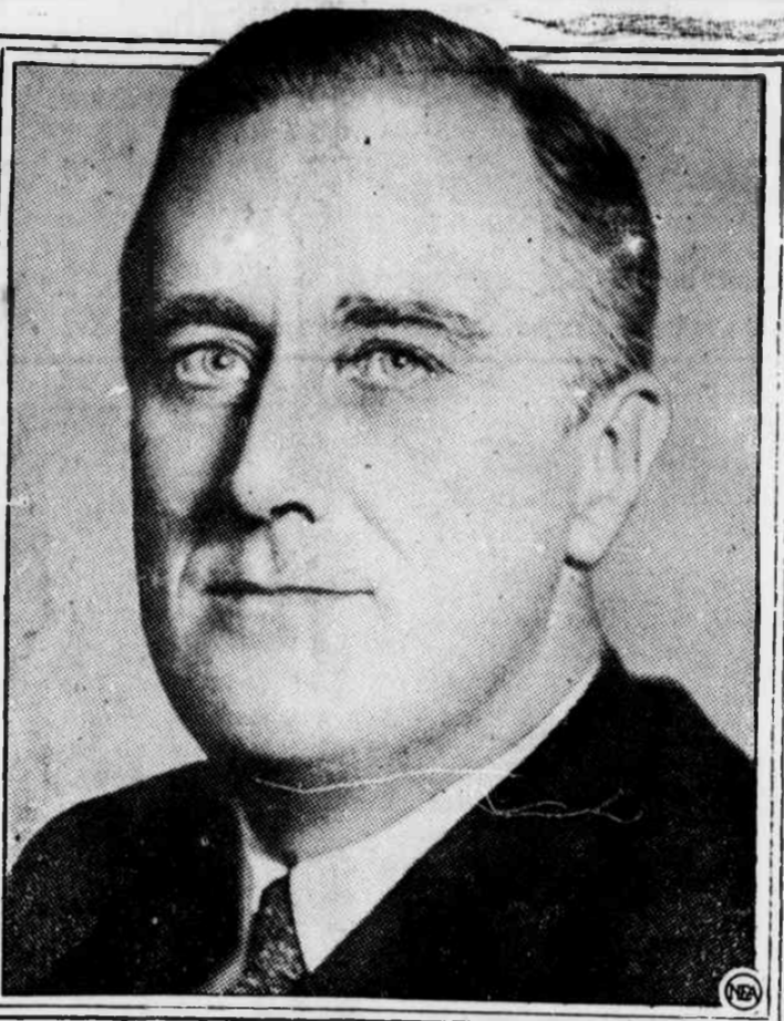
President Franklin D. Roosevelt