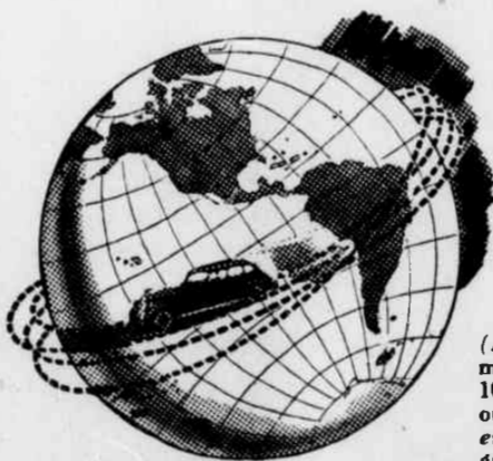
(Left)—4 TIMES AROUND EARTH. A man drove his automobile on GULFPRIDE OIL 100,000 miles—without ever needing a repair, without ever having the head off the motor, without ever adding one drop of oil between drains. Expect great things of GULFPRIDE—you'll get them!