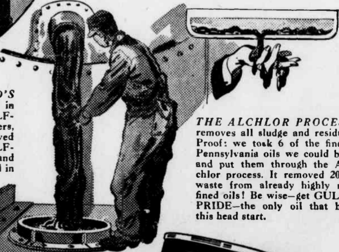
THE ALCHLOR PROCESS removes all sludge and residue. Proof: we took 6 of the finest Pennsylvania oils we could buy and put them through the Alchlor process. It removed 20% waste from already highly refined oils! Be wise—get GULFPRIDE—the only oil that has this head start.

Read the facts on this page. Then drive into any Gulf dealer's—and replace your old summer-worn oil with GULFPRIDE now.