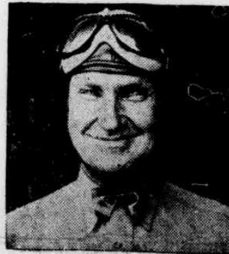
JOHNNY CROWELL Internationally famous stunt pilot and up-side down flyer.