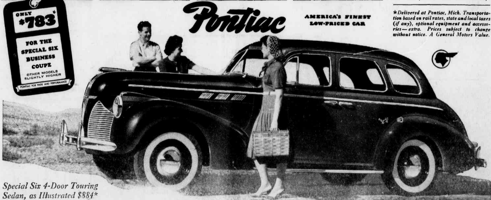
Special Six 4-Door Touring Sedan, as Illustrated $884*

Where else can you get a big car, with all the advantages only a big car can offer, that is just as easy to buy and just as economical to own as a small car? See your Pontiac dealer today!