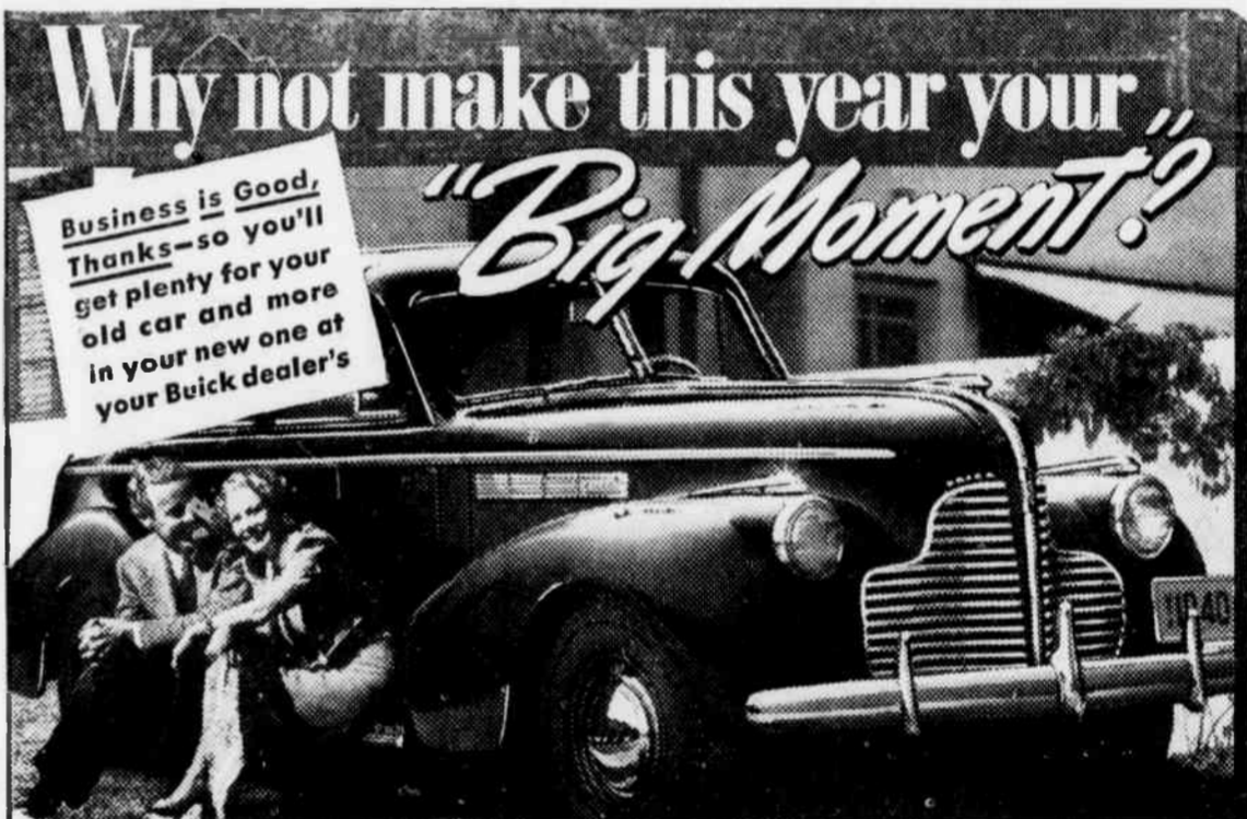
Above is the Buick SPECIAL 4-door touring sedan $896*

WE'RE talking here to those thousands who have not yet achieved their lifetime ambition to own a Buick.