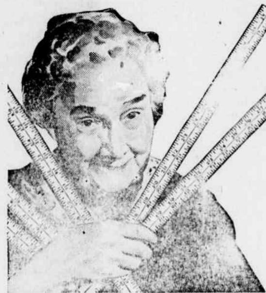
"I've looked them all over, By every yardstick Hotpoint is a great buy."