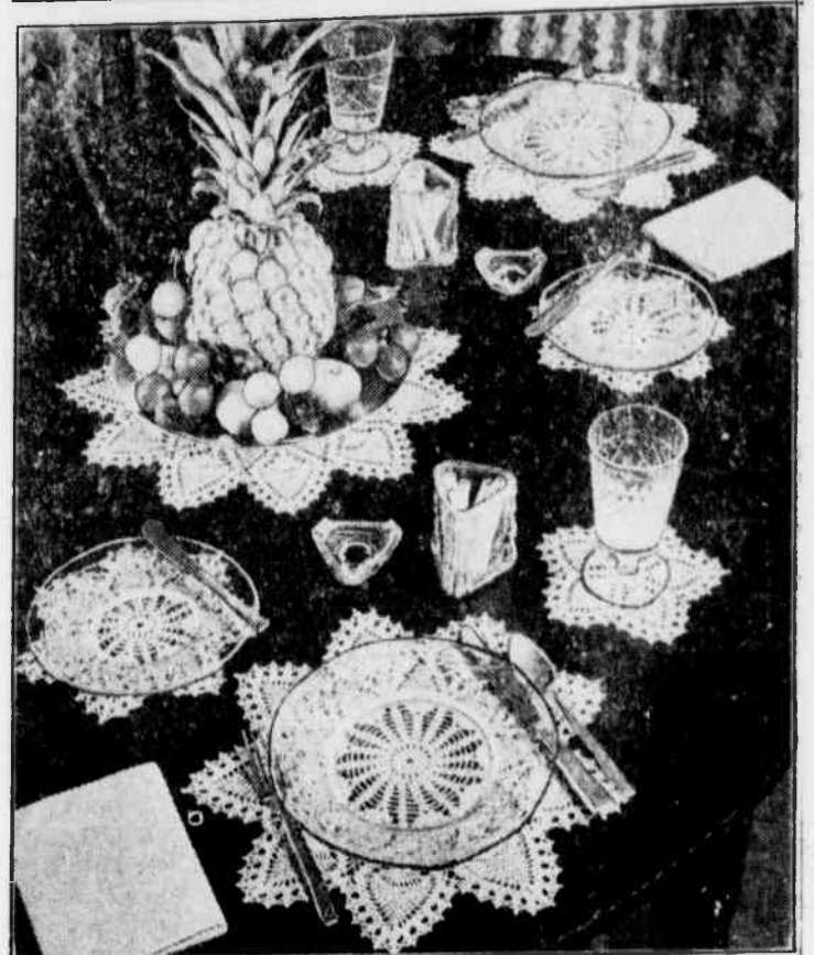
BACK from the rich Indies, Yankee Clippers brought the lordly pineapple—and housewives borrowed its design to create the classic pineapple motif in crochet. Here it is charmingly used in repeating circles for this luncheon set with a flavor as traditional as the early New England, where the design was first used. Crochet this heirloom design for your own luncheon table, using white or ecru mercerized crochet cotton for a crisp, firm finish and long wear. Directions for making this luncheon set may be obtained by sending a stamped, self-addressed envelope to the Needlework Department of this paper, specifying design #7335.