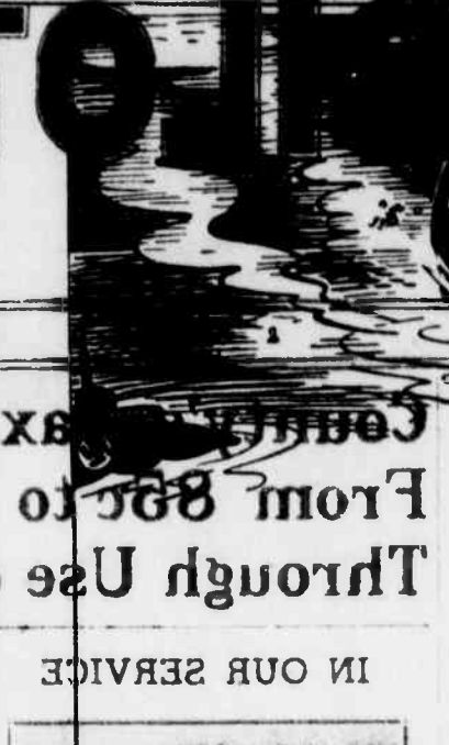
Dr. Monroe's Plan Related in Harpers Magazine Article Tells Proposal to Use Hotels in Event of Emergency

Says a little filler in one of our State's metropolitan papers, "Destruction of tires or tubes or other rubber products, except by permit, is illegal in Canada." Such regulations in this country would be effective only if they included destruction of tires and tubes by those found at the corners of two wheels and skidding to a four-wheeled brake stop.