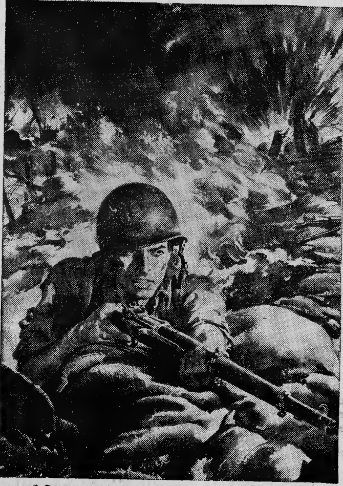
"... Ask the Joes in the front lines!"