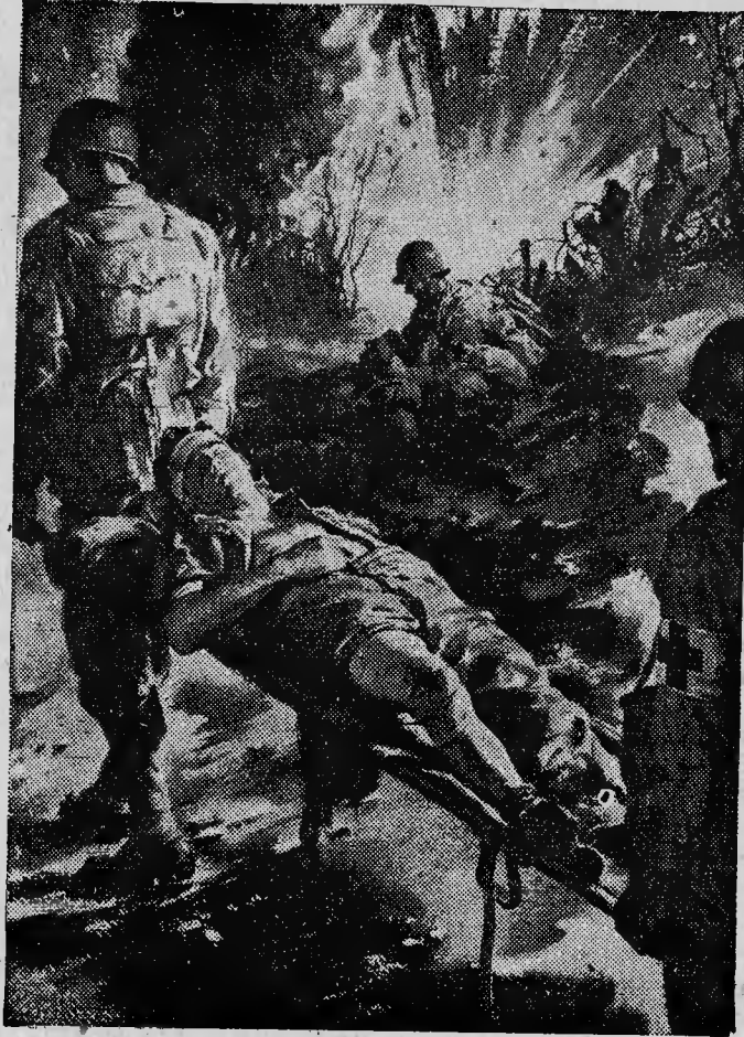
"... Ask that kid on the stretcher!"