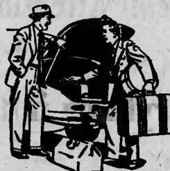
TUCK AWAY PLENTY! Roomy luggage compartments hold plenty — and high-lifting lids make it easy to get at any piece.

After all, we can't do much about getting one to you till you make your wishes plain. You do that simply by placing your order — which will get equal consideration whether or not you have a car to trade.