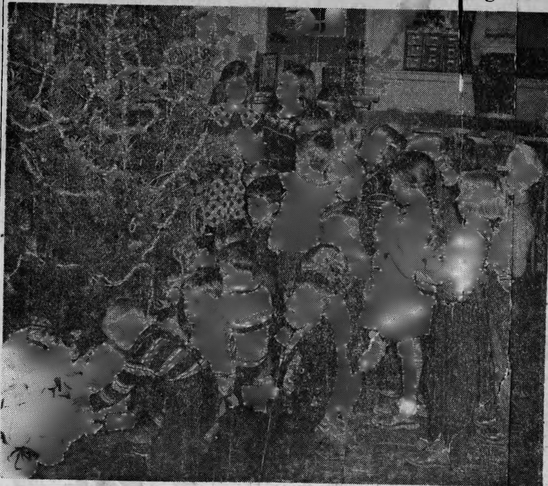
On the last day of school before the holidays began, the schoolchildren had their "WhChristmas" bringing gifts of food to lay beneath the Christmas tree. Here are the first graders, with his gift to add to the growing pile. The cans of food were later distributed in Christmas baskets sent out by the Council of Social Agencies.