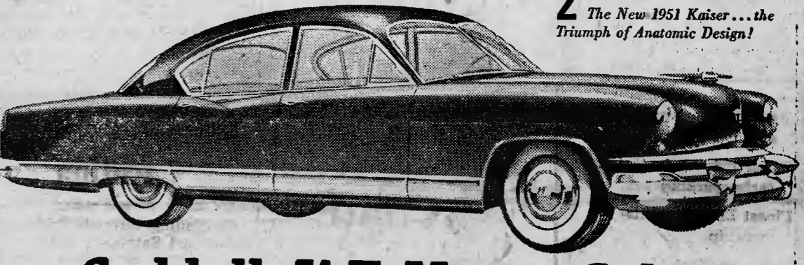
The New 1951 Kaiser... the Triumph of Anatomic Design!