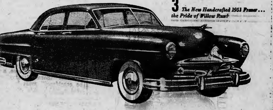
The New Handcrafted 1951 Pro... the Pride of Willow Run!

as the newest authorized dealer for the 3 newest cars in America!