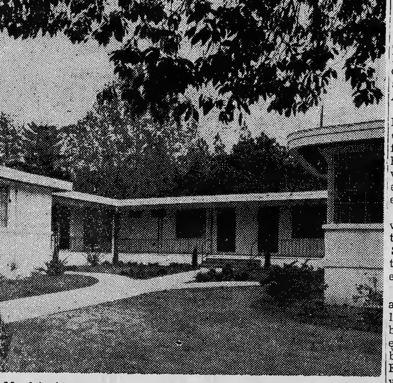
The distinctive and handsome new Mayfair Apartments, North May street at New Hampshire avenue, are opened here this week.